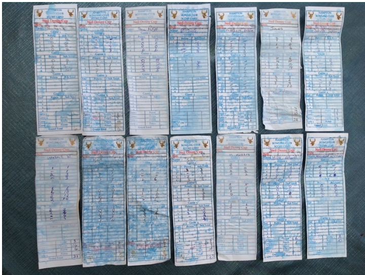
To emphasise the difficulty of the conditions, here is a selection of the players' soggy scorecards handed in at the conclusion of play.