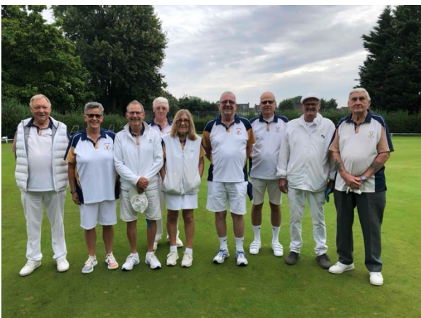
Hampton Bowling Club

Overhead conditions on Friday could be described as 'dreek'! At any point it seemed possible that an umpire might emerge brandishing a light meter!